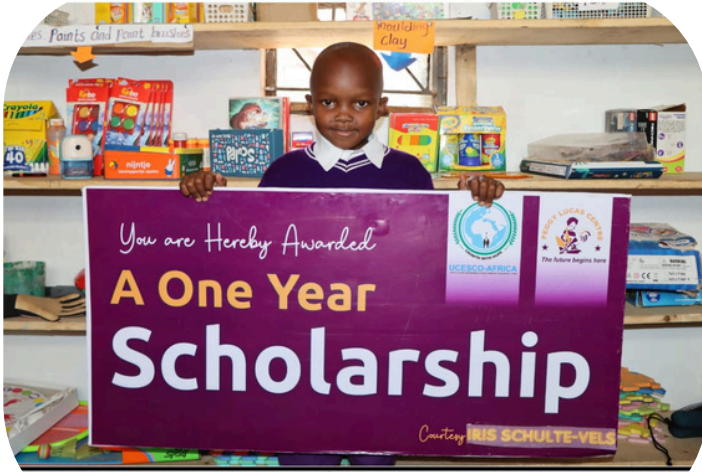
NAME: Fidel Castro